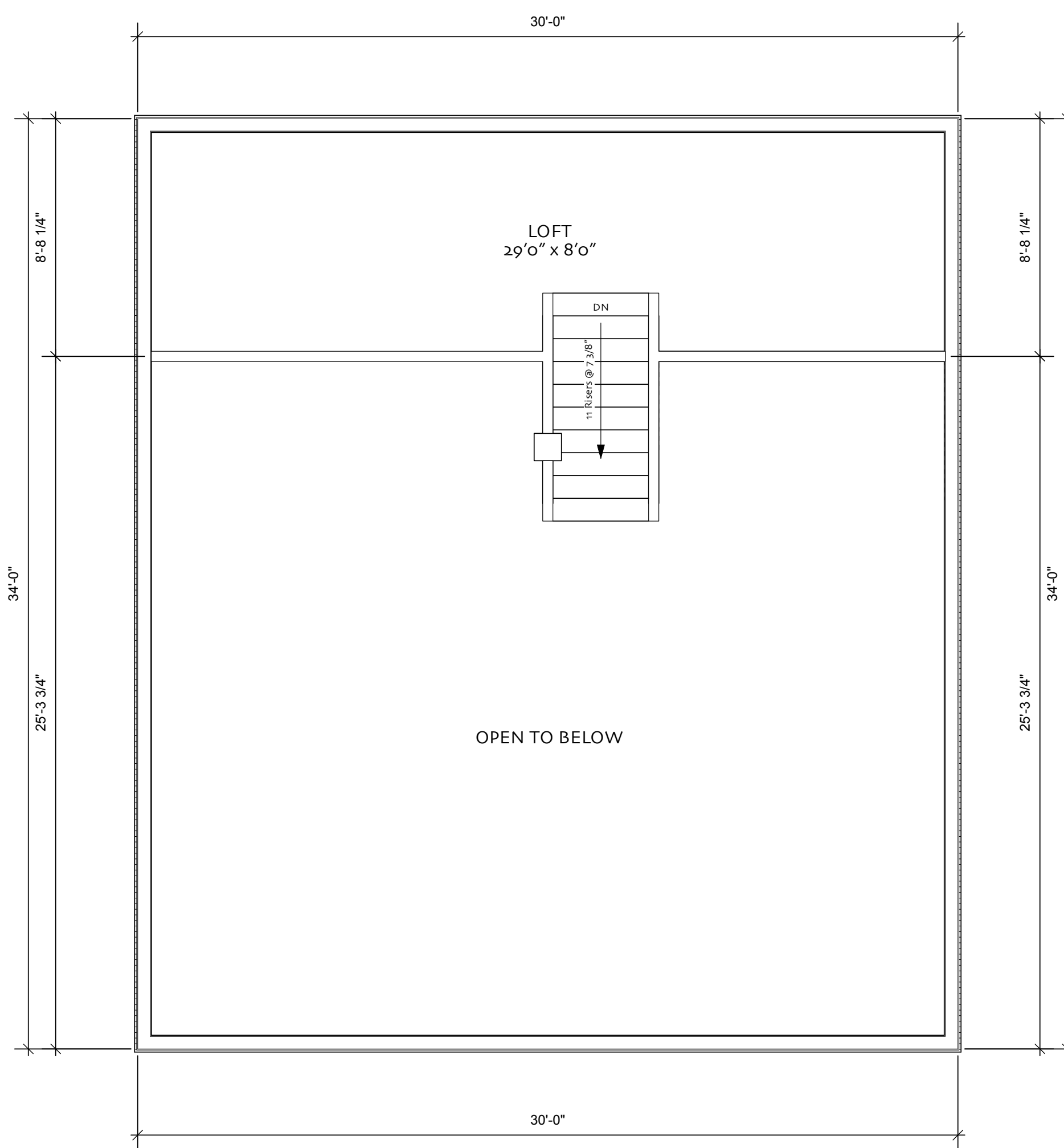
2 Loft Plan Scale: 1/4" = 1'-0"